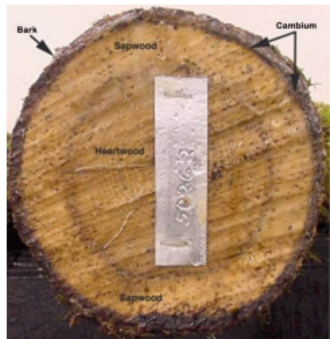
Figure 2. The lighter, outermost wood is the sapwood and the darker, inner wood is the heartwood.

If you cannot fell the trees and cut them up in the same day, you can leave the whole trees in the woods uncut and untrimmed for up to 7 to 10 days. Then, cut them to size and inoculate within a few days. You can also