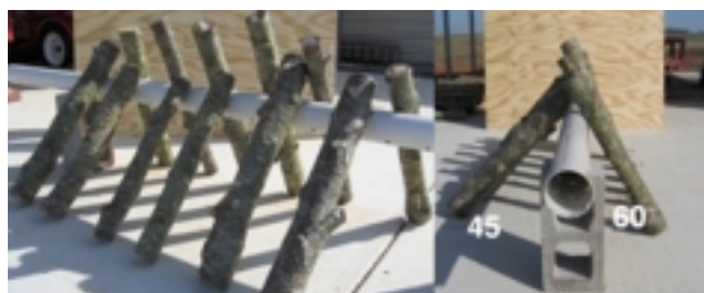
Figure 6. Typical A-frame stack, often used during harvesting.

Logs can be stacked several ways during mycelia run. The most important factors are good aeration, moisture, and temperature. If logs are leaned against a tree or "A-frame" stacked, they will tend to lose moisture rapidly (see Figure 6).