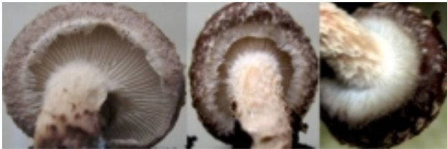
Figure 12. Shiitake mushrooms store better if harvested shortly after the veil breaks and the gills are exposed. Gills are fully exposed on the left and the veil has not broken on the right.

The mushrooms can be harvested at any time by cutting or twisting the stem off the log. Be sure not to leave pieces of the stem sticking out past the bark. Mushrooms are best if harvested shortly after the gills are exposed (see Figure 12).