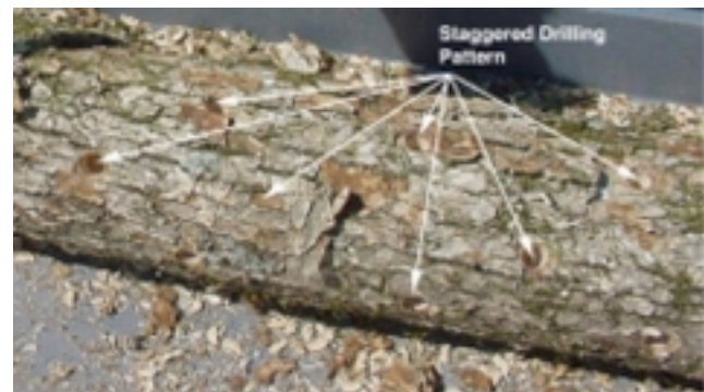
Figure 4. [above] Drill down the length of the log with a 4- to 6- inch spacing, then stagger the next row of holes about 2-inches below or above the first row. Continue around the log.

Drill 1-inch deep holes into the log in a diamond pattern: 7/16 inch diameter for sawdust spawn, 5/16 inch for dowel. The first row of holes is drilled down the length of the log; each hole should be 4 to 6 inches apart (see Figure 4). The second row of holes should be staggered two-inches below or above the first row. Continue this pattern around the log (see Figures 4 and 5).