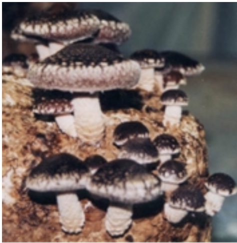
Figure 11. You can harvest several pounds of shiitake mushrooms from a sawdust block.