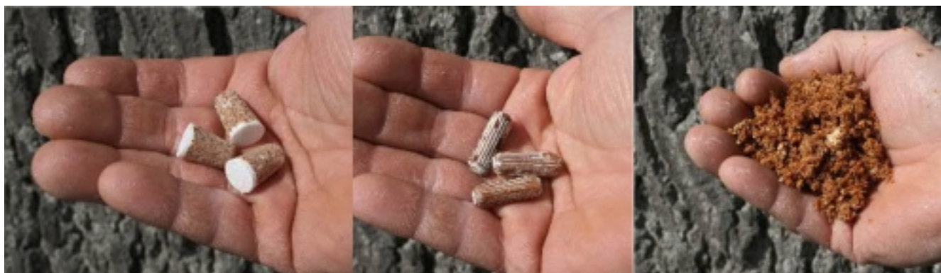
Figure 1. Shiitake strains can be purchased as thimble (left), dowel (center), or sawdust spawn (right).

If the spawn is brown and loose, the mycelium is not well knitted and it was sent to you before it was ready for you to use. You can store unknitted spawn at about 65 to 70 degrees F in a humid environment for a few weeks to see if it will turn white. Or you can return the unknitted spawn, ask for your money back, or replace it with a white bag of spawn. If you receive your spawn more than a few days before you plan to inoculate, you should place it in the refrigerator or a very cool basement. Move spawn to room temperature about 24 hours before you plan to inoculate. When ordering a pre-inoculated log or sawdust block, make sure you tell the supplier the fruiting temperature conditions to get the right inoculated strain.