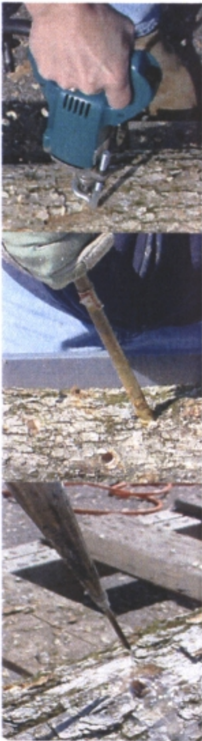
Figure 5. Drilling, inoculation of log with inoculation tool and sawdust spawn and waxing with a baster.

Inoculate the logs immediately after the holes are drilled. The inoculation tool will fill the holes to the bark level with sawdust spawn (see Figure 5). For dowel spawn, use a hammer to securely insert dowels into the drilled holes. Sawdust spawn can be placed in the holes by hand if you do not have an inoculation tool. This method is time consuming and exposes the spawn to more contaminants. Be sure the dowel or sawdust does